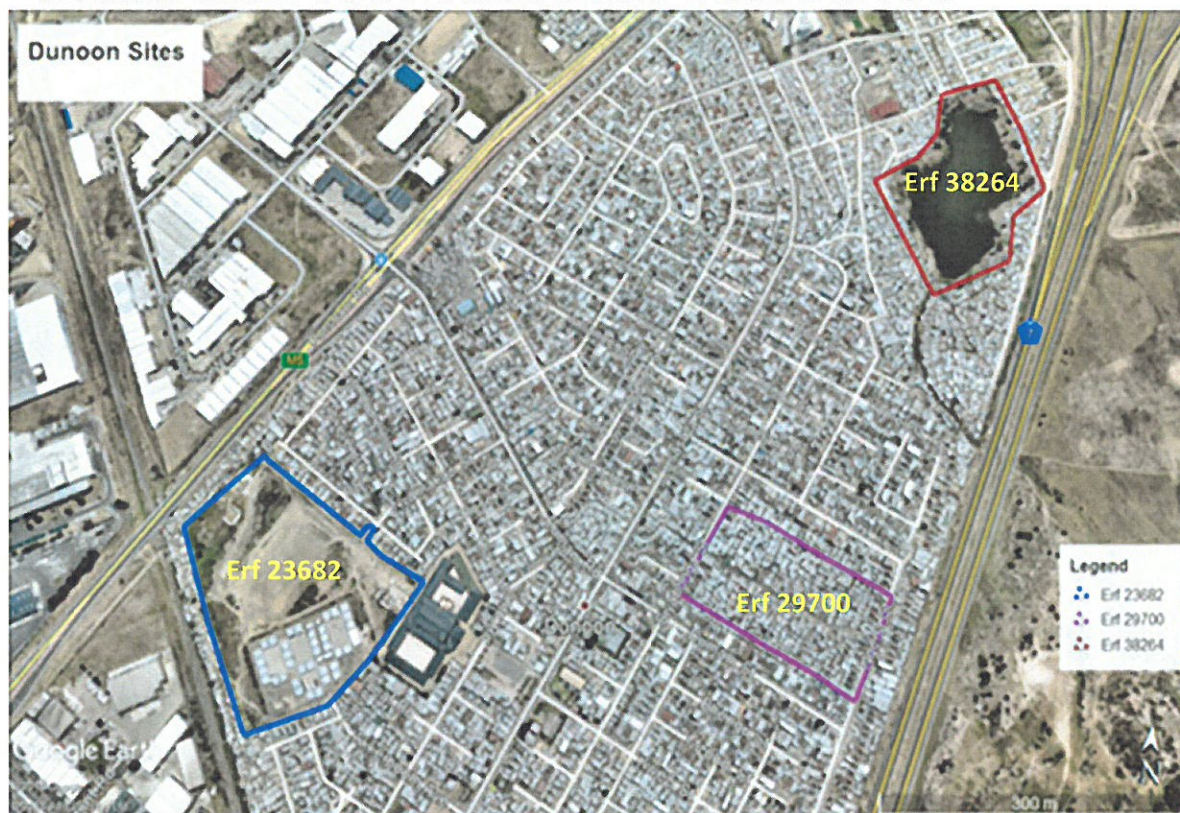
Aerial map: Erven 38264, 29700 and 23682, Dunoon Township

GPS coordinates: 33°49'07.6"S 18°32'31.9"E and 33°49'03.6"S 18°32'19.3"E.