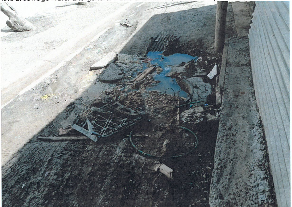
Photo 3: A manhole cover spilling out raw sewage at Ethembeni Informal Settlement