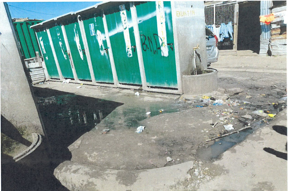
Photo 2: Sewage water and general waste at blocked public toilets (Erf 29700)