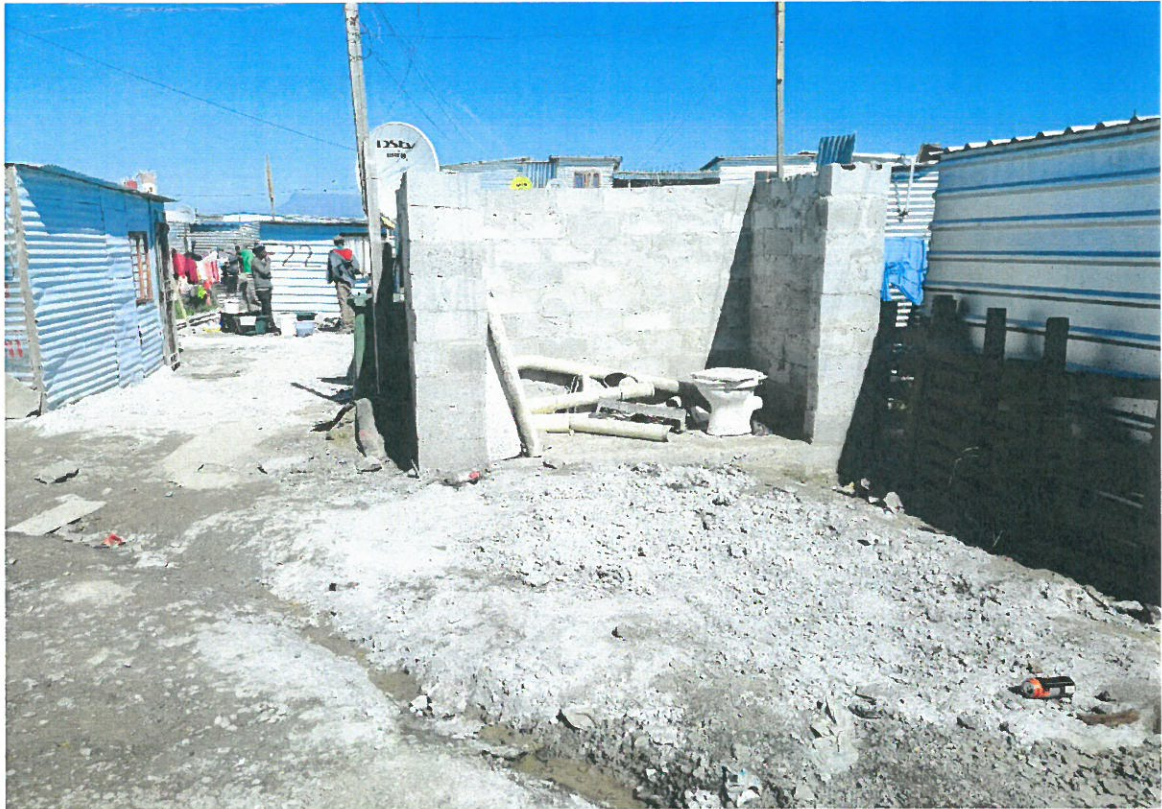
Photo 8: A collapsed public toilet constructed on Erf 23682 Dunoon by residents at Ekupholeni Informal Settlement,