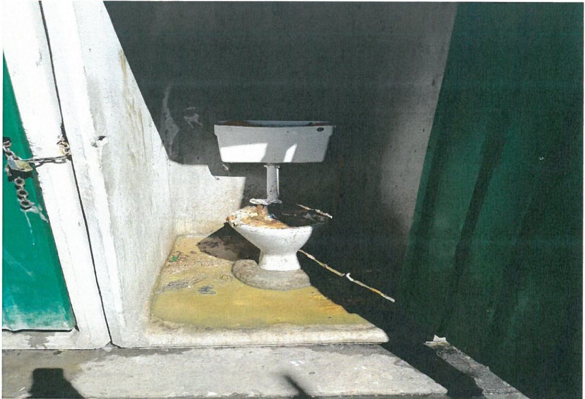
Photo 1: A blocked toilet overflowing with faeces on top and around toilet seats at Ethembeni Informal Settlement (Erf 29700)

degradation of the environment and that you have not taken reasonable measures to prevent such pollution and/or degradation from occurring, continuing and recurring.