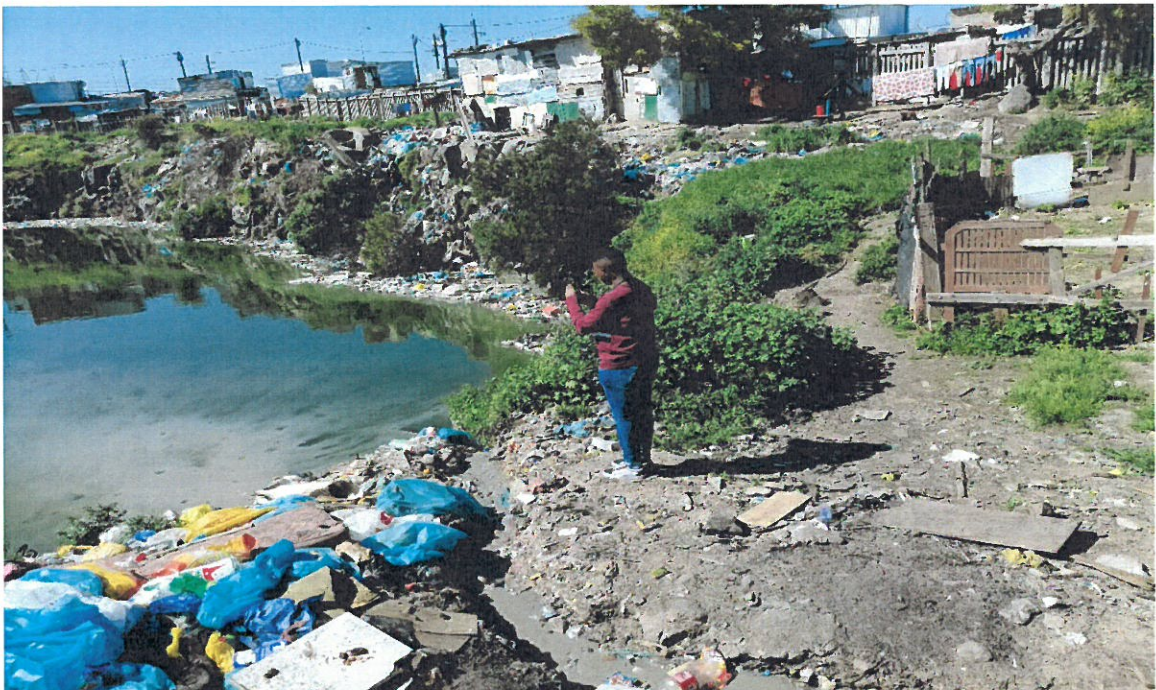
Photo 7: A dam located at Erf 38264, adjacent to N7 road with a substantial amount of waste present on-site